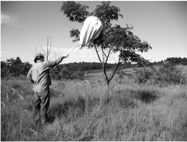
Fig. 1. Psyllids sampling with a beating net in the middle in a seven-year-old plantation of Enterolobium contortisiliquum in an abandoned open-pit coal mine in Candiota, RS, between May 2014 and April 2016.

and is utilised for a variety of purposes. It is planted as shade tree in streets and gardens as well as in agroforestry systems, e.g., for cocoa and yerba mate. Its rapid growth and nitrogen-fixing abilities make it useful for revegetation, soil stabilisation and improvement, as well as land reclamation. It is tolerant of copper-contaminated soil. The tree is also harvested for its timber and medicinal uses, and the foliage is eaten by cattle (Praciak et al., 2013).