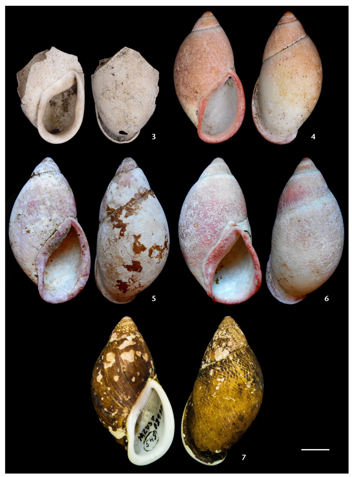
Figures 3–7. Shells of Mirinaba cadeadensis : (3–4) LEBIO 578, from the Boguaçu shell mound; (5) LEBIO 587, from Morro Itaguá; (6) LEBIO 588, from Morro Itaguá; (7) MZUSP 18998 (holotype), from Cadeado. Measurements of these specimens can be found in Table 1. Scale bar: 10 mm.