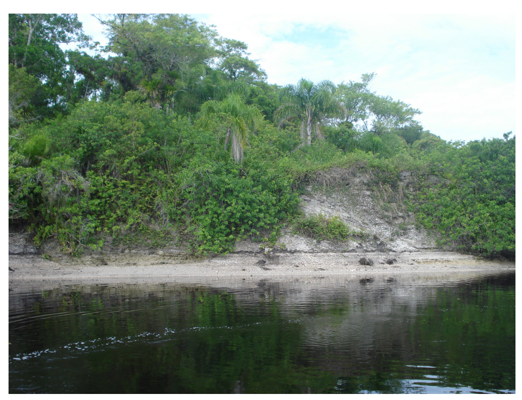
Figure 2. Overview of the Boguaçu shell mound, in Guaratuba Bay, Paraná, Brazil.

The two shells present the characteristic abrasion usually found in shell mound specimens, having a whitish color due to the action of time, and the absence of periostracum. One specimen does not have the protoconch and the adjacent part of the teleoconch. Nonetheless, the characteristics of both shells clearly match those of present-day specimens, including the type specimens, and are within the expected individual variation for species of Mirinaba (Indrusiak and Leme, 1985). Measurements of all specimens are shown in Table 1.